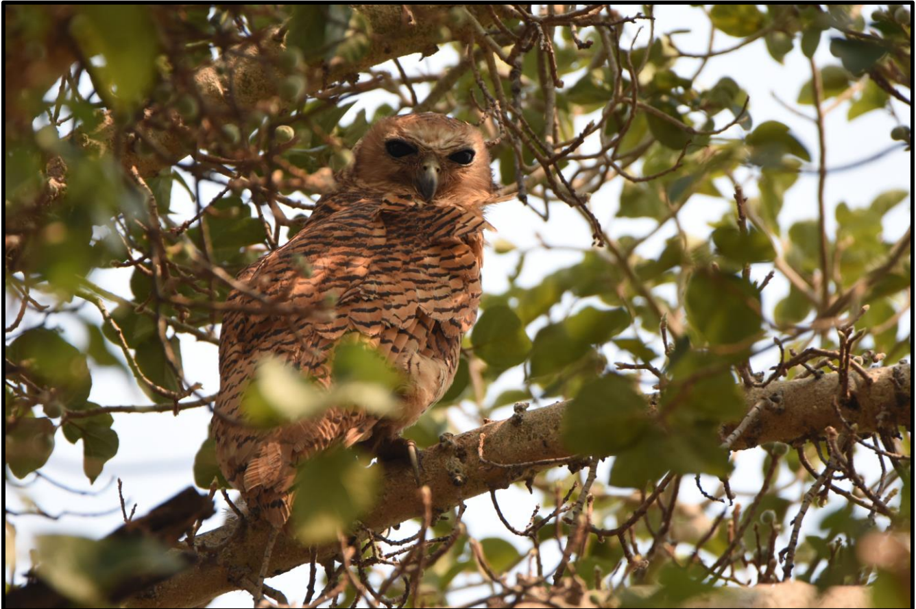
Pel's Fishing Owl